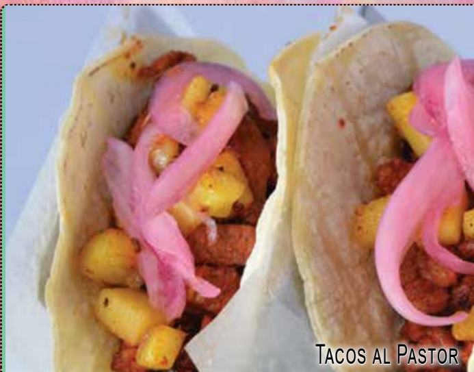
TACOS AL PASTOR