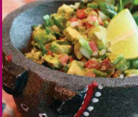
TABLE SIDE GUACAMOLE

Chicken quesadillas, beef nachos and chicken flautas. Served with fresh guacamole, sour cream, pico de gallo, jalapeños and cheese dip – 14.25