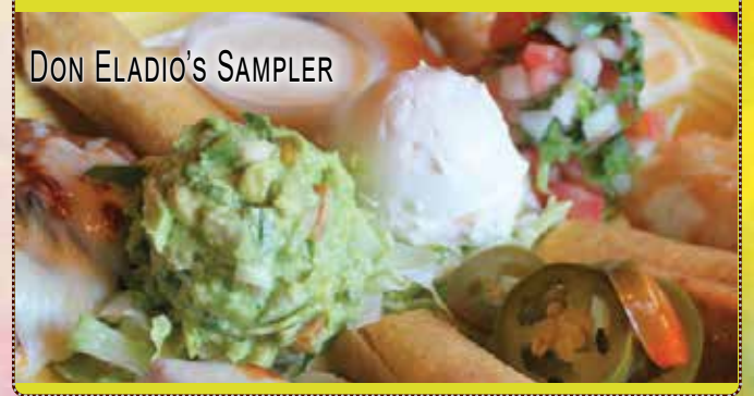
DON ELADIO'S SAMPLER

Fresh pineapple, strawberries, cucumbers, mangos and jicama served over romaine lettuce with balsamic vinaigrette. Topped with roasted pumpkin seeds. Chicken – 11.25 Salmon – 14.25